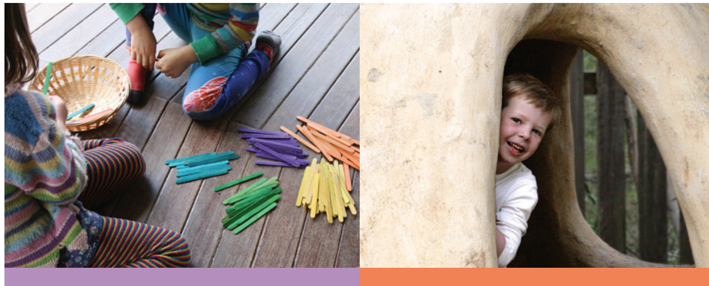
Build strong peer connections