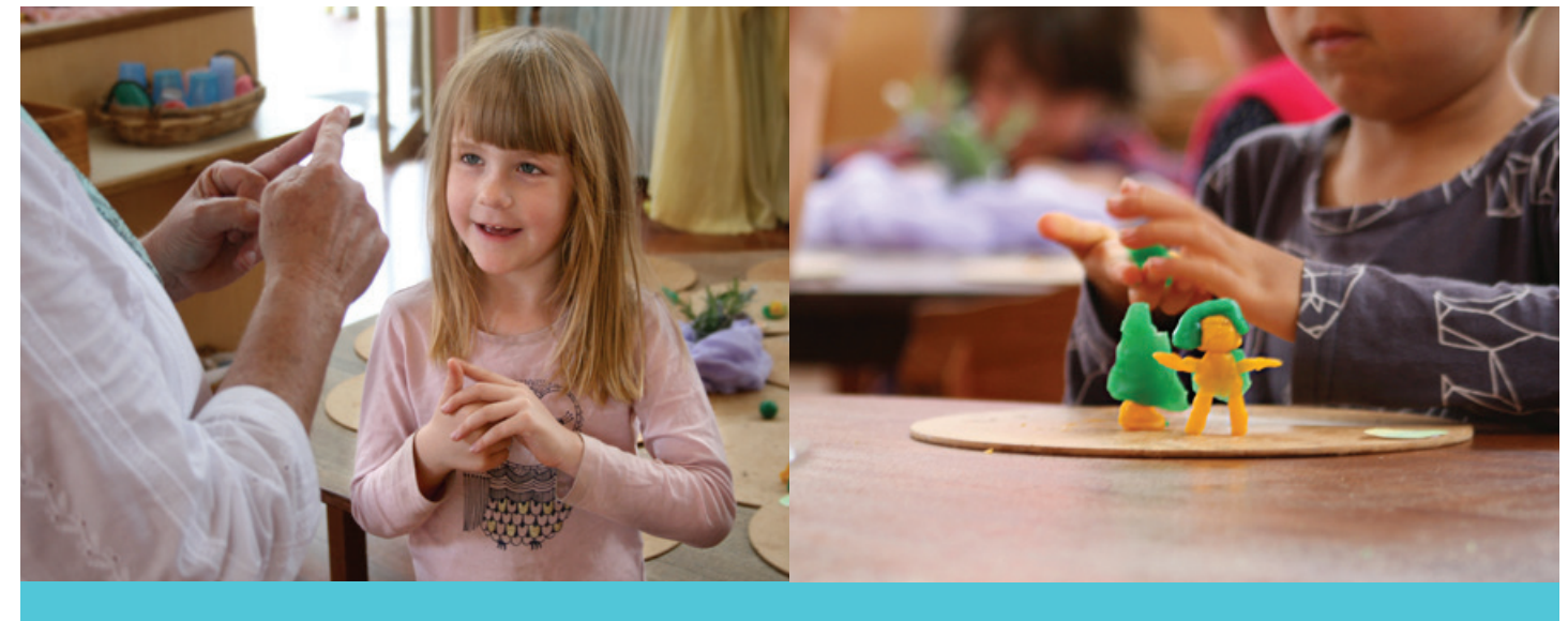
Sign Language Program from 4 yrs

To Enrol in Pre-kindy Please call for more information. Alternatively email or return the Expressions of Interest Form on p11 to receive our enrolment packages.