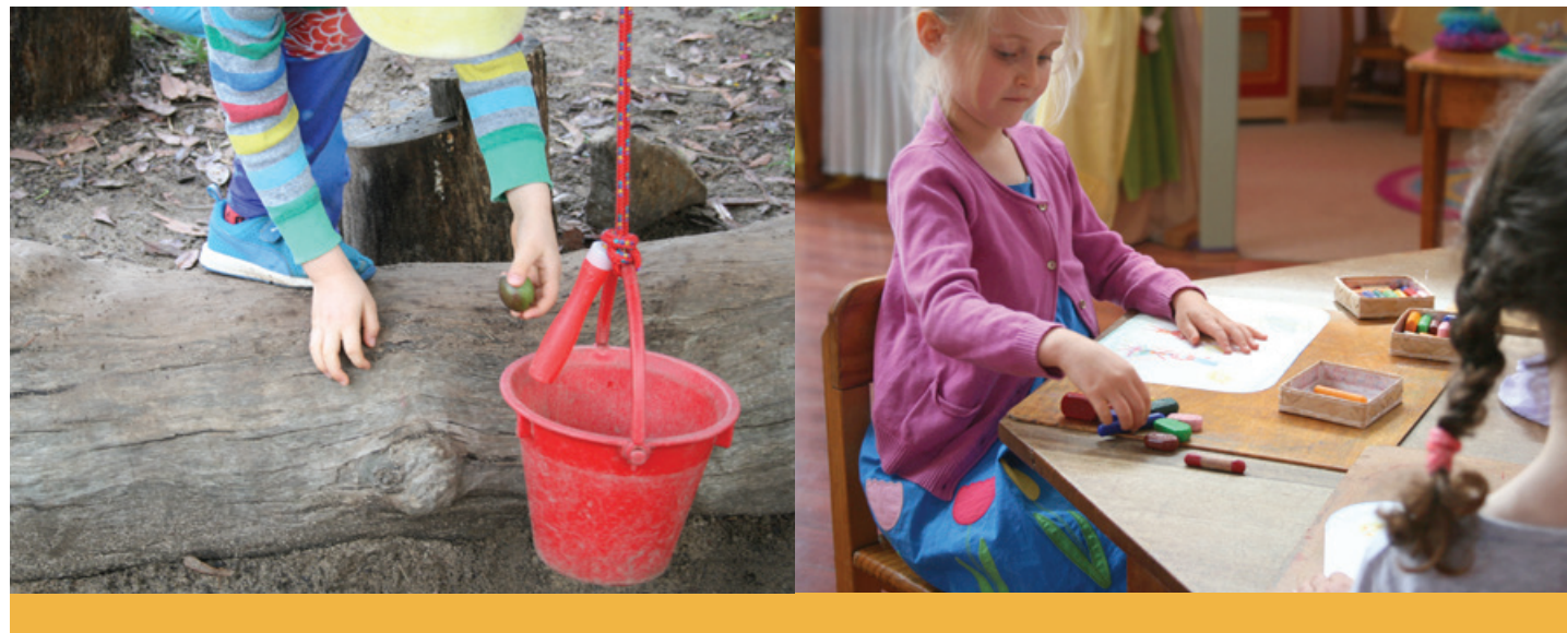
Hands on learning experiences