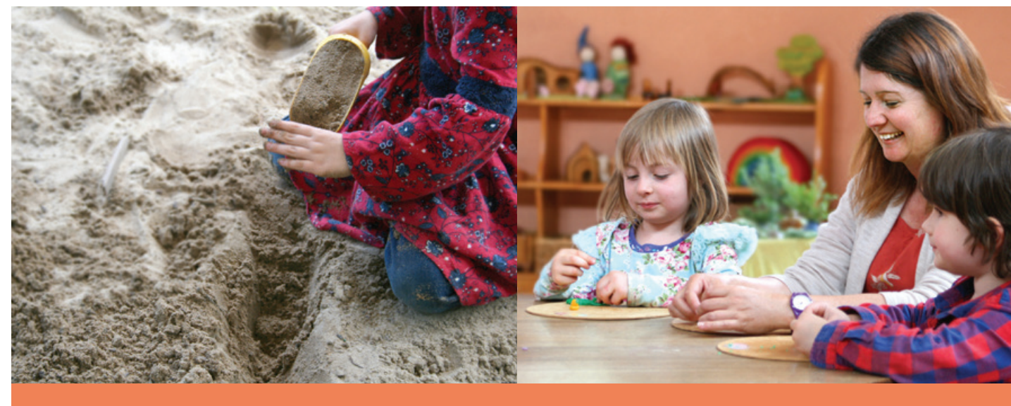
Learning through play

Email: admin@bluemountainssteiner.nsw.edu.au