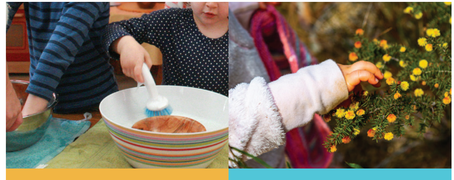
Collaborate and communicate

In the natural, rhythmical and creative environment of our Early Learning programs, children are given the freedom, confidence, independence and security to prepare for the next phase of their school life.