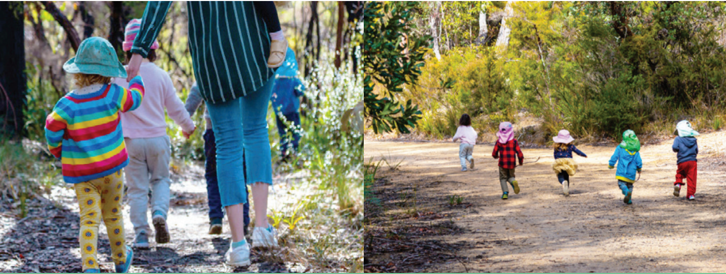
Supported bush play in our greater school grounds